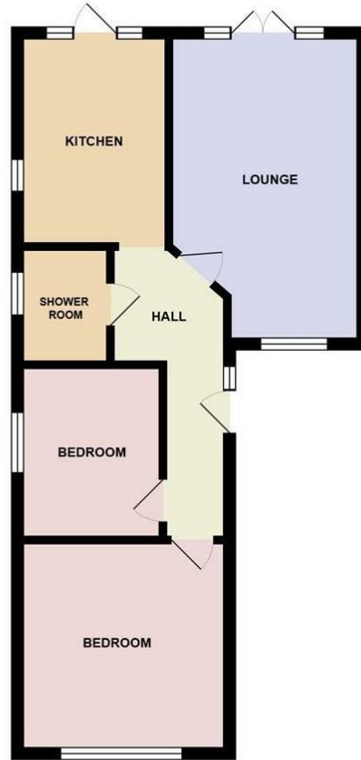
36 Birchwood Drive Leigh on Sea SS9 3LE